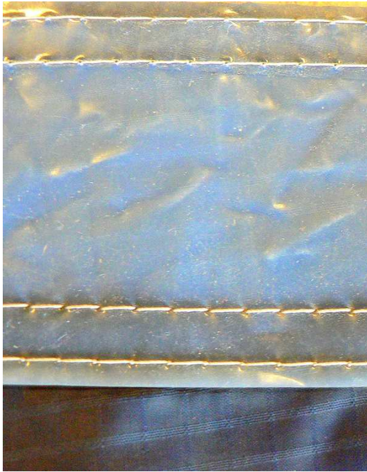
Window without edge tape - AFFECTED